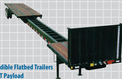
48-80 ft. Extendible Flatbed Trailers 28 T Payload