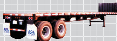
42 ft. Flatbed Trailer • 9 T Payload